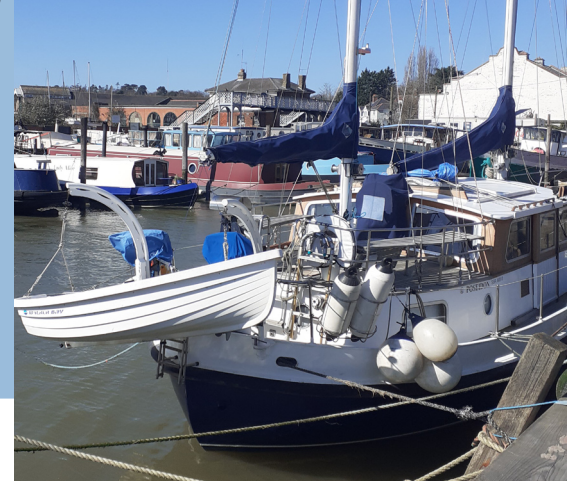
Funded by East Suffolk Travel Association supported by a grant from the East Suffolk Lines Community Rail Partnership.

EVERY CARE HAS BEEN TAKEN WITH THIS LEAFLET BUT WE CANNOT BE HELD RESPONSIBLE FOR ANY ERRORS OR CHANGES. April 2023